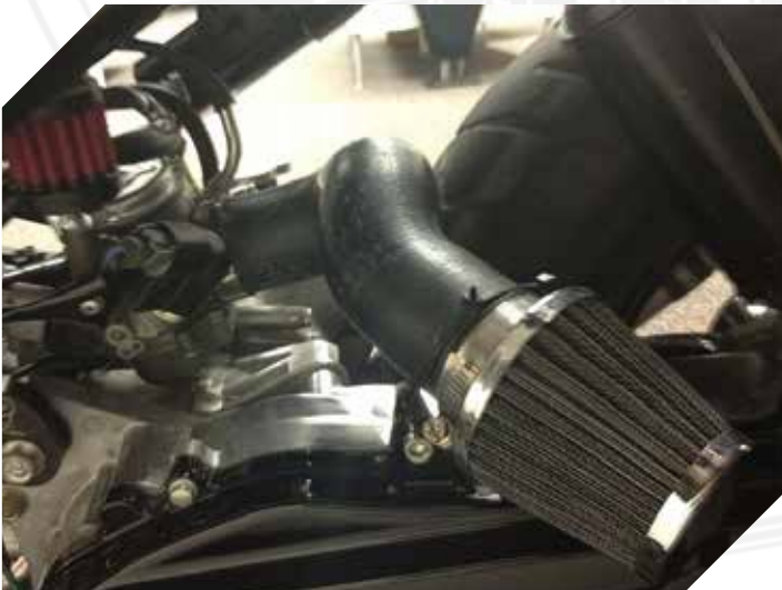
Installed Type 1 (Type 2 is the same just with different filter)

Use the 85 jet and shim the needle first. If it still bogs you then use the 38 idle.