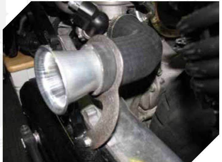
TVR Intake installed